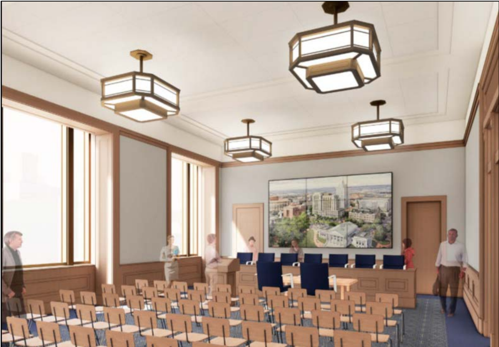
Finished Subcommittee Room Rendering