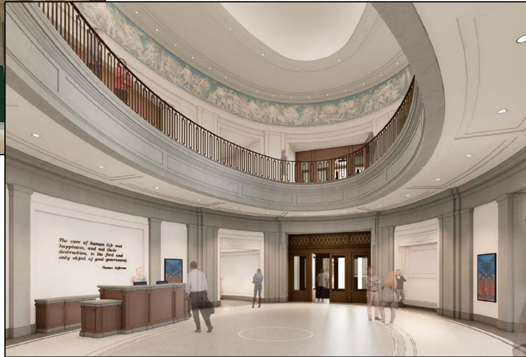
Finished Main Lobby Rendering