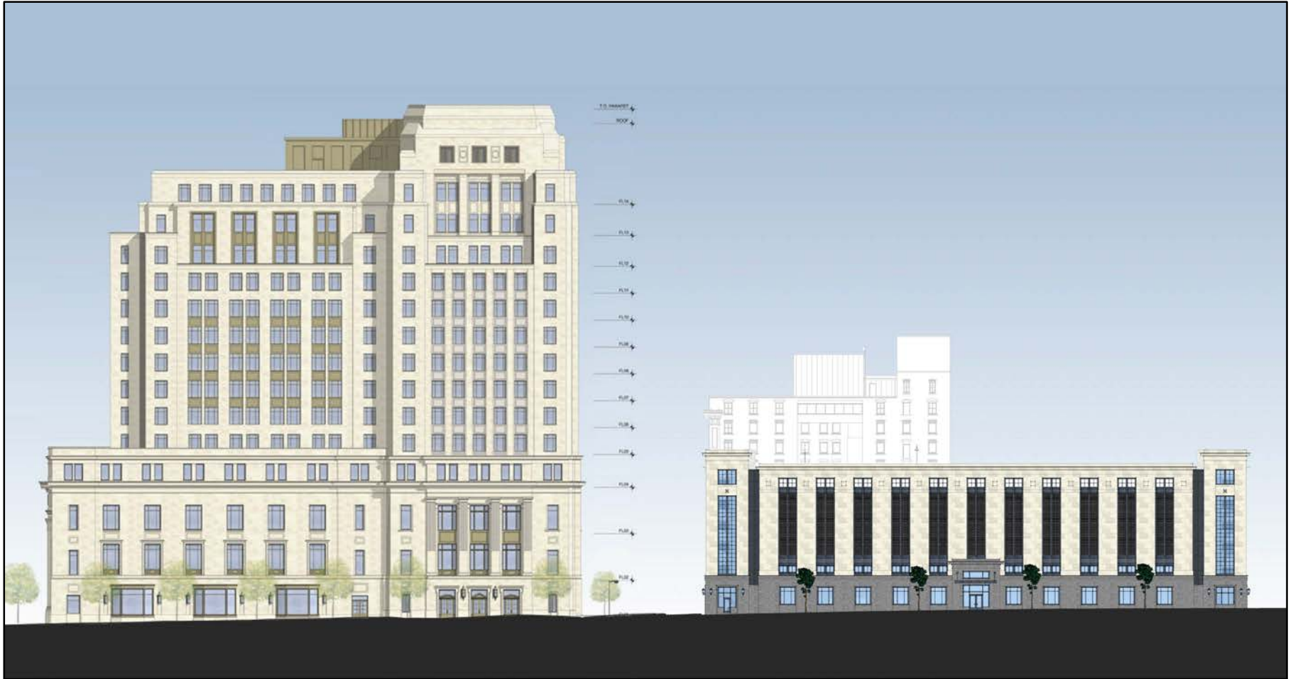
View from Broad Street