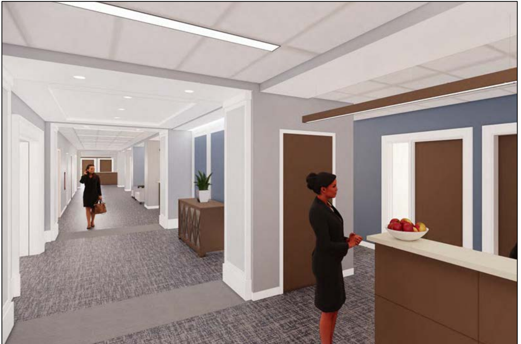
Finished Office Floor Rendering