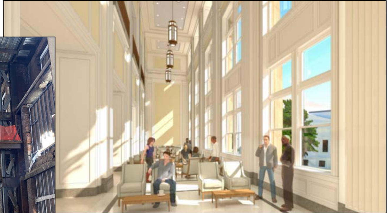
Finished 2 nd Floor Atrium Rendering